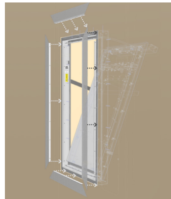
A bead edge profile is fixed to align with the opening edge to allow a plaster finish to be skimmed up to the opening.