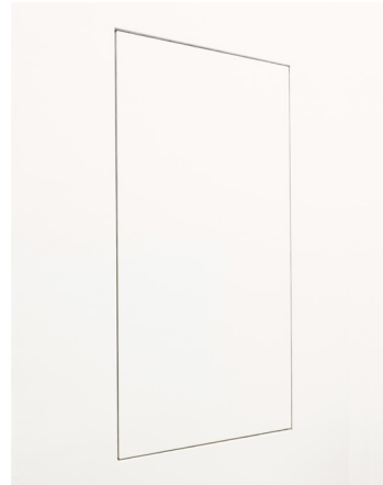
Unobtrusive when closed.