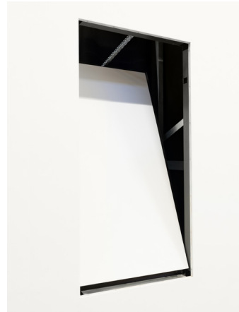
Effective ventilation when open.