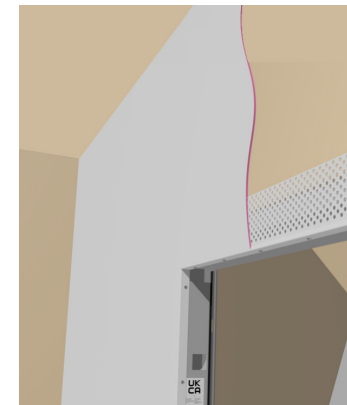
Plaster and site paint finish in any standard interior wall paint or emulsion.